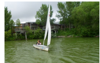
Sailing at Fort Whyte