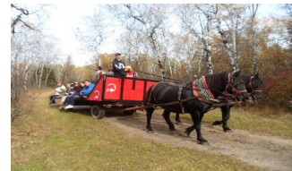
Sleigh Ride at Bird's Hill Park