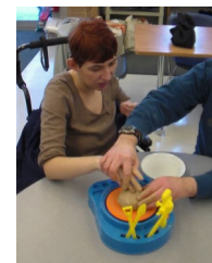
1-1 with Sensory Instructor