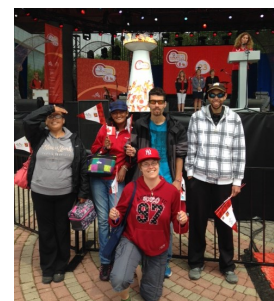
Group Outing (Pan Am Torch Run)

CONTACT INFORMATION: Alternative Solutions Day Services: 717 Portage Avenue, Wpg, Mb, R3G 0M8. ASDS@newdirections.mb.ca ; or visit Alternative Solutions Day Services at www.newdirections.mb.ca