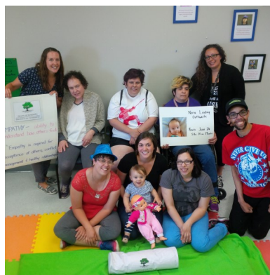
Roots of Empathy Class