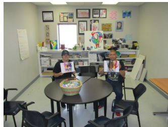
Cultural Craft & Resource Classroom